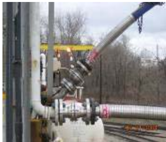
Typical Breakaway Coupling Installations